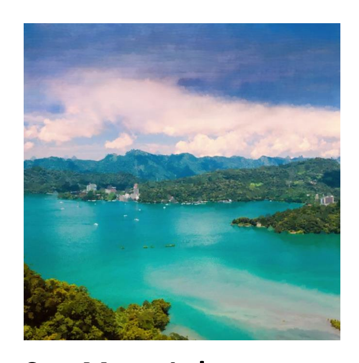
Sun Moon Lake is located in Nantou City, Taiwan, and it is the largest naturally-occurring body in Taiwan. Its name came from the east side of the lake resembles a sun, and the west side resembles a moon.